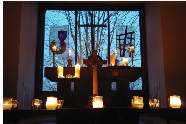
Our Wednesday Evening Vesper Services.